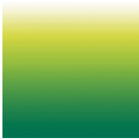
ZADIG Cactus 36 Print pattern