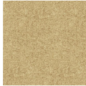
ELAINA Beige 63