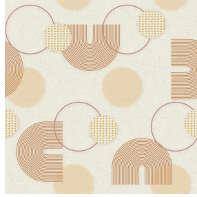
6013 Ocre 03 Print pattern