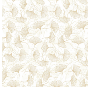
6060 Naturel 26 Print pattern