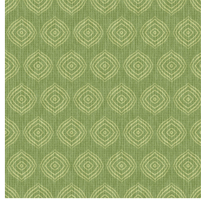
LYLA Prairie 125 Print pattern