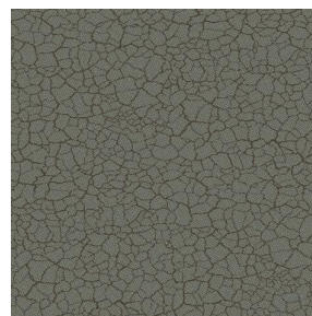
TERRA Gris 97