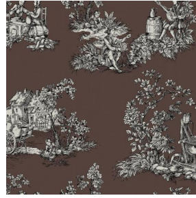
ZELIE Taupe 95