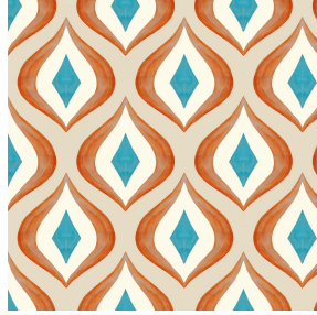
WILLY Multico 98 Print pattern