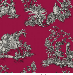
ZELIE Rubis 59