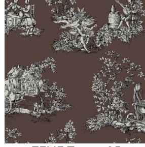
ZELIE Taupe 95