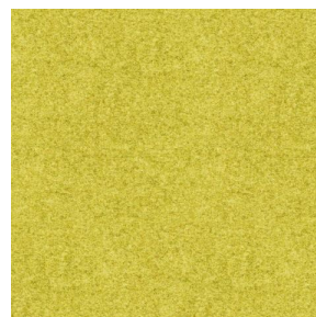
ELAINA Bergamote 121