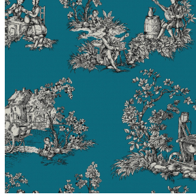
ZELIE Céladon 135 Print pattern