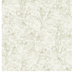
6048 Beige 63 Print pattern