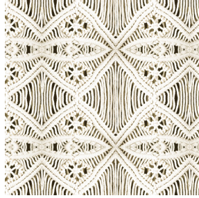
PETULA Naturel 26 Print pattern