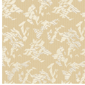
6018 Ocre 03 Print pattern