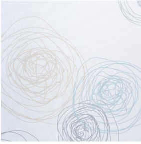
NAHIA OR 94