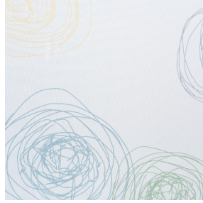
NAHIA TURQUOISE 53 Print pattern