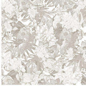
6105 Beige 63 Print pattern