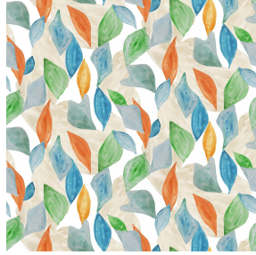
AQUARELLE Multico 98 Print pattern