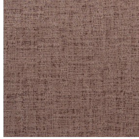
MURA DUNE 170 Print pattern