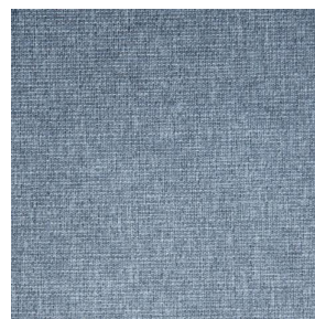
MUNA Tourterelle 138