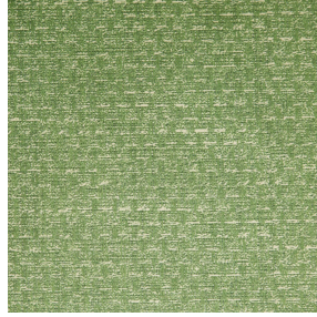
RUSTIC Mousse 92 Print pattern