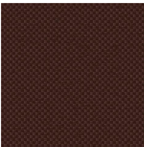
CHARLOTTE Chocolat 70