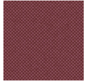
CHARLOTTE Chaudron 118