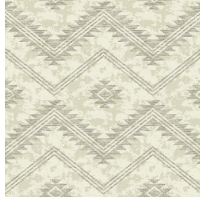
6037 Beige 63 Print pattern