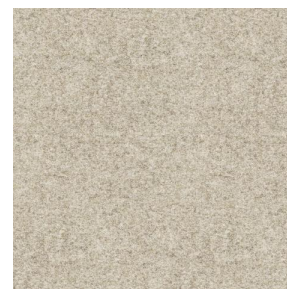
ELAINA Lin 11