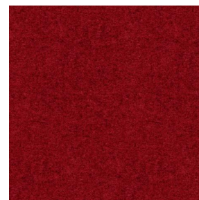
ELAINA Fiesta 131