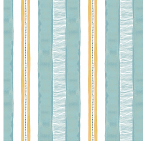
TITUS Multico 98 Print pattern