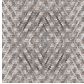
ECHO Lin 11 Print pattern