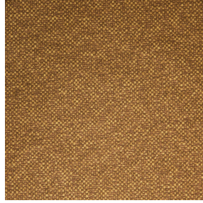
ANATOLE Or 94 Print pattern