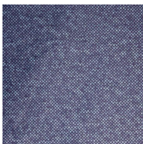
ANATOLE Océan 91