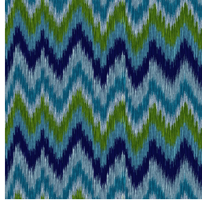
BIJAPUR Bleu 41 Print pattern