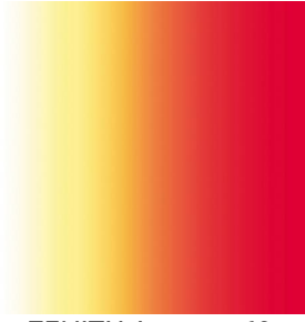
ZENITH Agrume 69