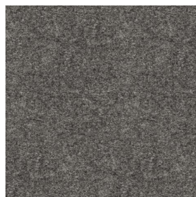
ELAINA Anthracite 38