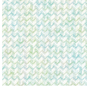
6017 Bleu 41 Print pattern