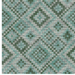
6030 Minéral 157 Print pattern