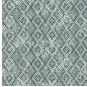
6032 Minéral 157 Print pattern