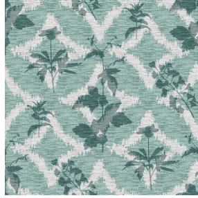
6045 Céladon 135 Print pattern