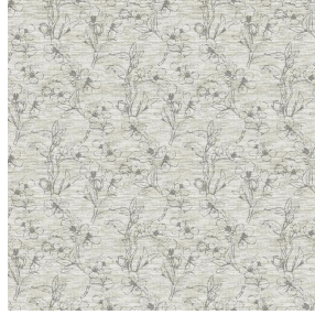
6049 Naturel 26 Print pattern