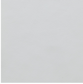
SKAILO Blanc 01 Printing support