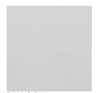
SKAILO Blanc 01 Printing support