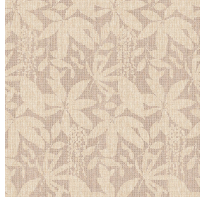
MARCO Chanvre 72 Print pattern