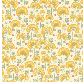
OMBELLE Soleil 127 Print pattern