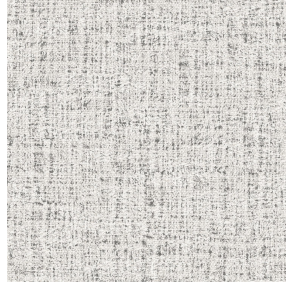
MURA MASTIC 48 Print pattern