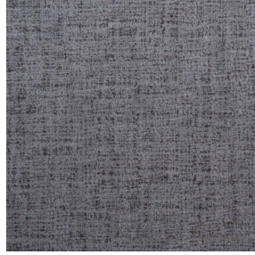
MURA ETAIN 180 Print pattern