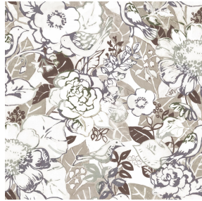
CHARMETTE Taupe 95 Print pattern