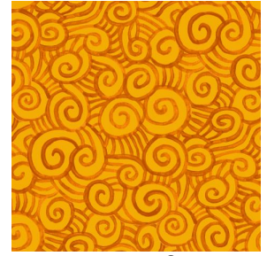
TUMULTE Safran 49