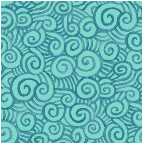
TUMULTE Menthe 122