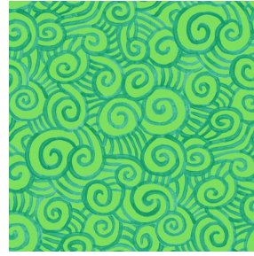
TUMULTE Prairie 125