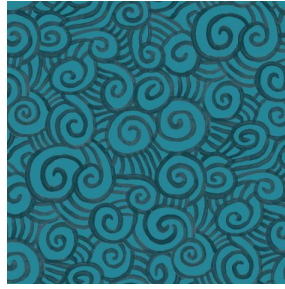
TUMULTE Orage 123