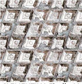
CLEMENTINA Ficelle 09