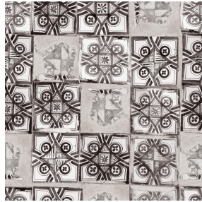
PAOLO Ficelle 09 Print pattern