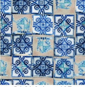
PAOLO Azur 137