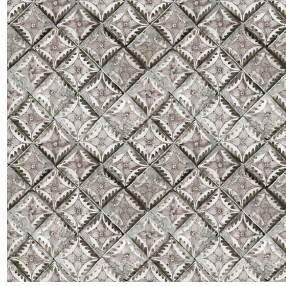
PIETRO Ficelle 09 Print pattern