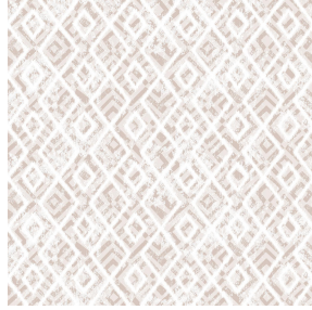
6033 Beige 63 Print pattern