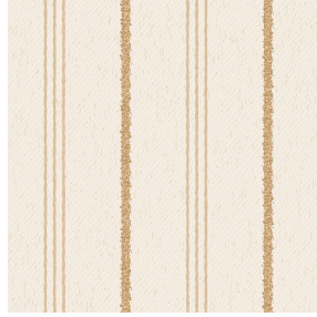
LIAM Naturel 26 Print pattern