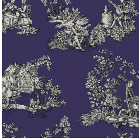
ZELIE Prune 84 Print pattern